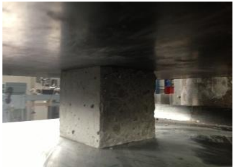
Figure 2. Strength tests on the concrete sample, after a period of care

Other untested concrete samples (six cubes , where the two cubes measuring 10x10x10 cm, 20x20x20 cm and 15x15x15 cm) are left to the fourteenth day of caring in normal environmental conditions, with three stamps that already cured under such a regime. After completion of the prescribed period of care is carried out the same test procedure, which establish the compressive strength of concrete cubes of different sizes.